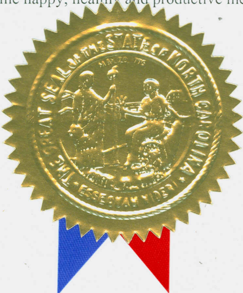
BEVERLY EAVES PERDUE

NOW, THEREFORE, I, BEVERLY EAVES PERDUE, Governor of the State of North Carolina, do hereby proclaim July 26, 2009, as "PARENTS' DAY" in North Carolina, and urge all parents to rededicate themselves to providing their children with the unconditional love that will help them become happy, healthy and productive members of society.